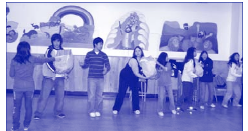
Youth group passing baskets of food to lower gym.