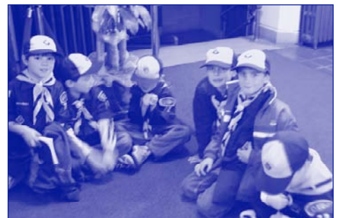
The Boy Scouts were assisting to reach out for our Lord.