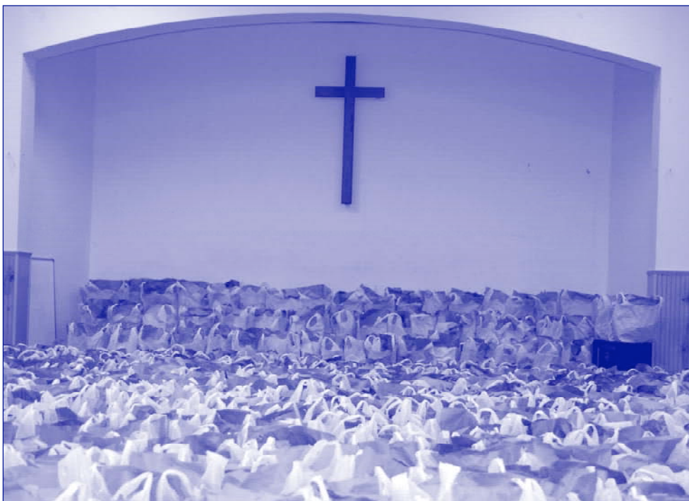
1,940 baskets of food to bring glory to God!