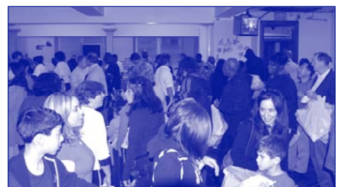
It takes many dedicated Christians to make Operation Brotherhood a success.